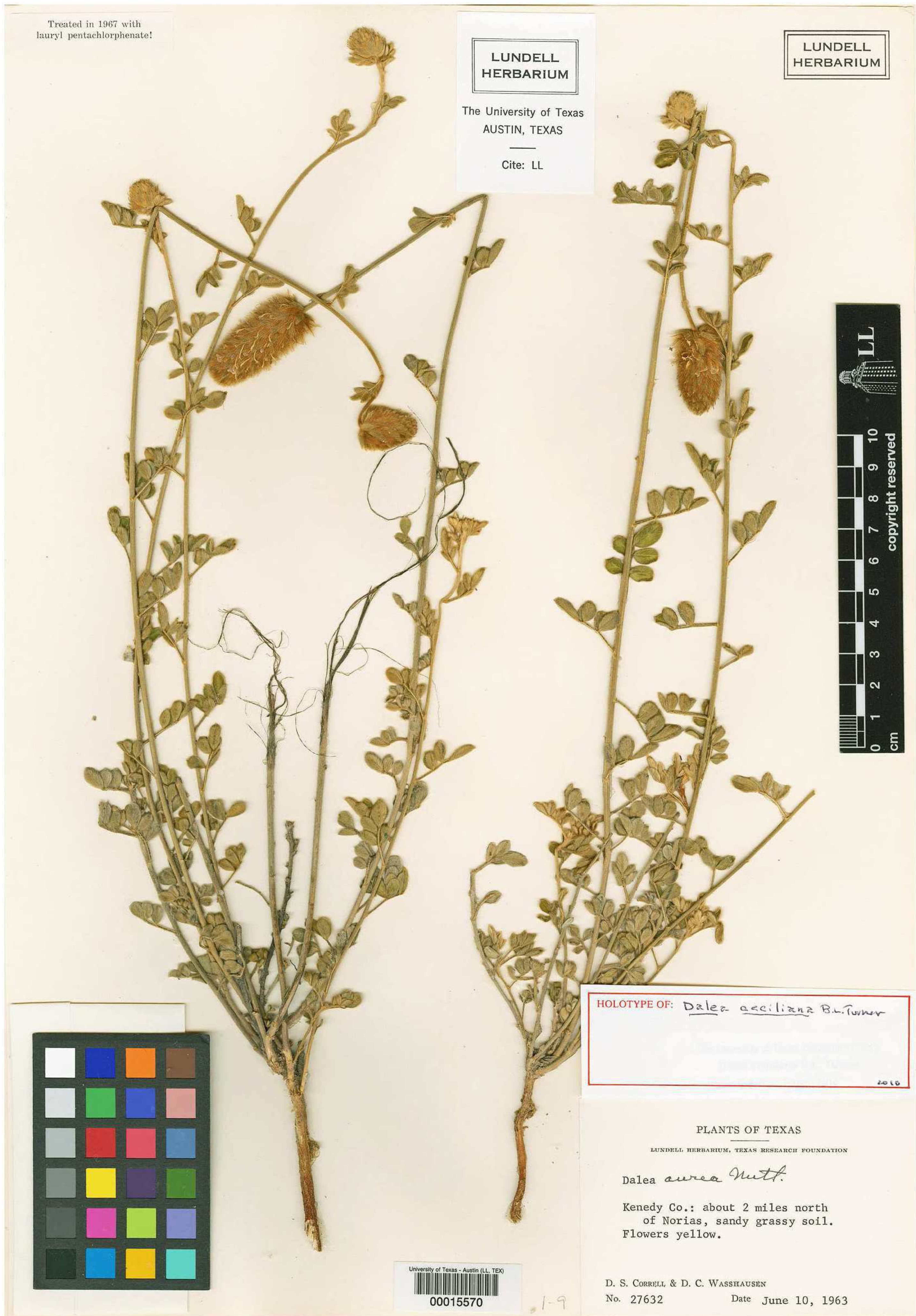
Figure 1. Holotype of Dalea ceciliana .